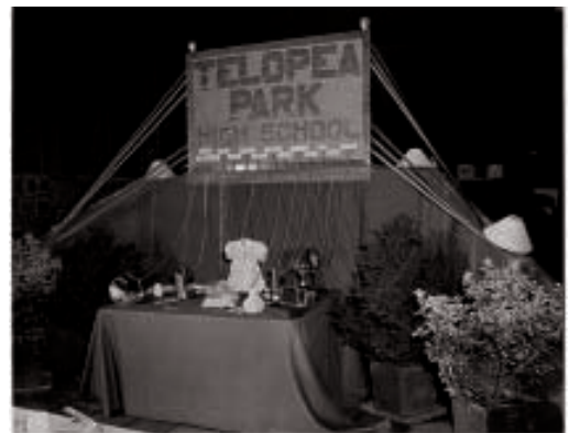
School Craft Displays c1955