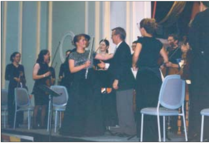
Canberra Youth Orchestra fundraiser Italian Tour 1998