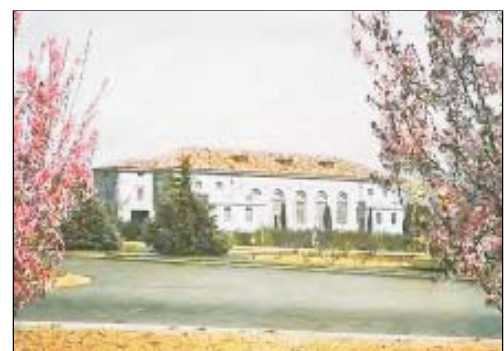
Springtime in Canberra c1956