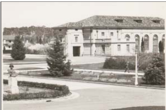
Bellona in situ c1953