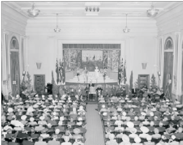
Citizenship Convention 1958