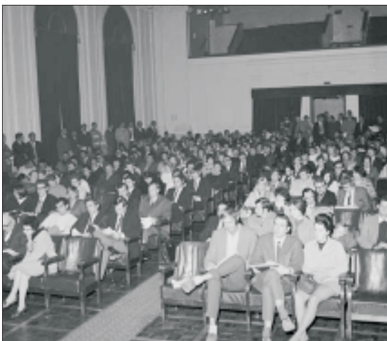
Land Auctions c1970