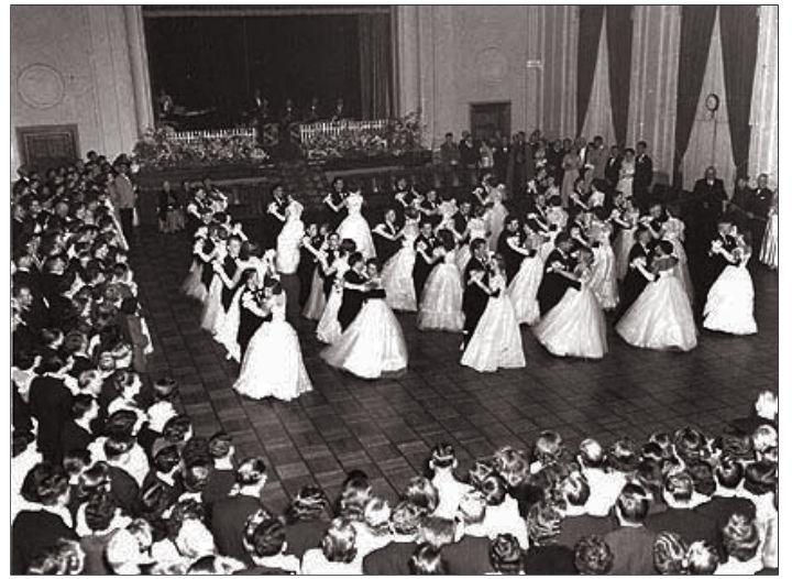
Debutante Ball c1956